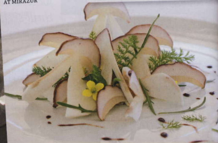
CEP CARPACCIO AT MIRAZUR